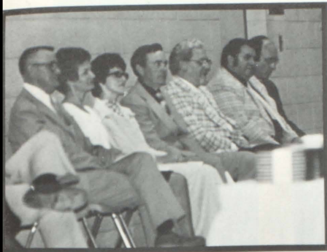
Board Of Education